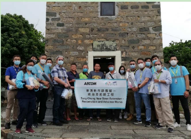
向白芒、大蠔及牛牯壟村民送上抗疫愛心包，以表達我們的關心和祝福 Giving caring packs to villagers of Pak Mong, Tai Ho and Ngau Kwu Long to express our care and blessing