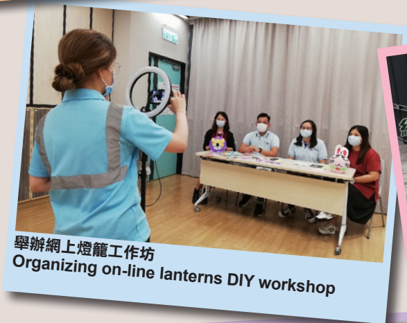
舉辦網上燈籠工作坊 Organizing on-line lanterns DIY workshop