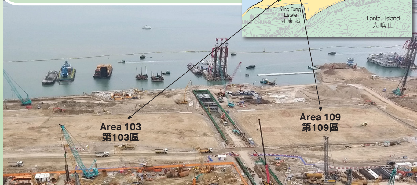
東涌第103區及第109區填海工程完成 Completion of Tung Chung Areas 103 and 109 reclamation works