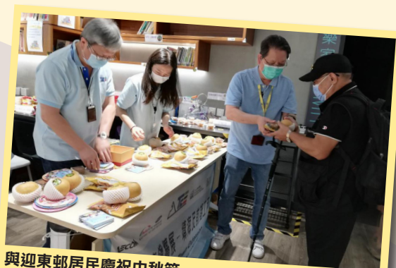
與迎東邨居民慶祝中秋節 Celebrating Mid-Autumn Festival with residents of Ying Tung Estate