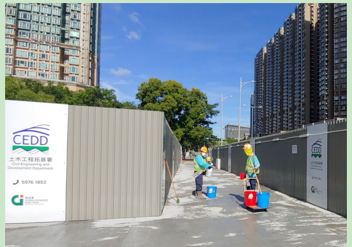
在工地周邊進行消毒工作 Conducting disinfection work along the peripheral of the site