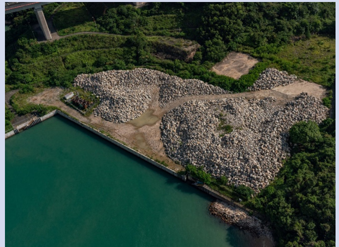
在汲水門臨時儲存原有護堤石 Storing original armour rocks temporarily at Kap Shui Mun