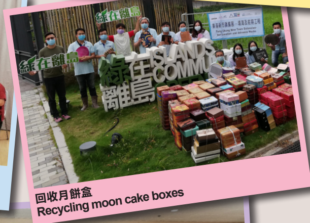
回收月餅盒 Recycling moon cake boxes