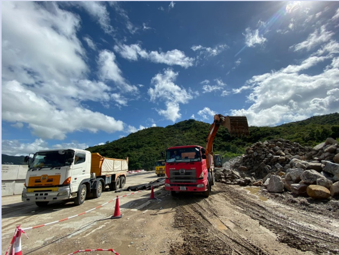
為原有護堤石進行分類 Sorting original armour rocks

We transport the original armour rocks to one of the works areas for temporary storage, where sufficient space is provided to facilitate collection and on-site sorting. These armour rocks will be sorted and processed according to their sizes with a view to maximising reuse of armour rocks for construction of the new seawalls.