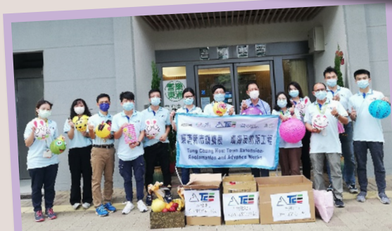
向護老院送上親手製作的中秋禮物，分享節日喜悅 Sharing festive joy by giving hand-made Mid-Autumn Festival gifts to elderly homes