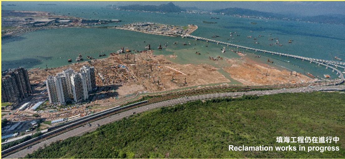
填海工程仍在進行中 Reclamation works in progress

Construction of seawall, placing of fill materials (including sand blanket and public fill) and deep cement mixing works are still in progress.