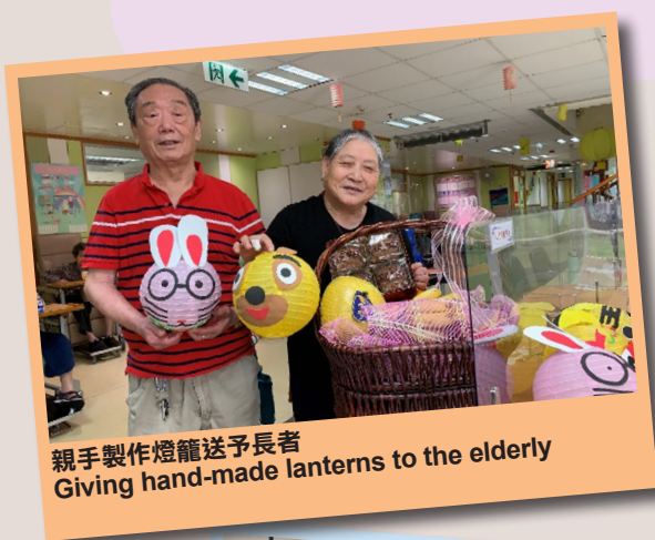
親手製作燈籠送予長者 Giving hand-made lanterns to the elderly

Mid-Autumn Festival is one of the traditional Chinese festivals. To add warmth and joy to this meaningful festival and help Tung Chung community in soothing the negative feeling aroused from the COVID-19 pandemic, the volunteer team "Builder" of Tung Chung East reclamation project arranged a series of festival activities to express our care to the community, including organising on-line lanterns DIY workshop for children, production of lanterns with blessing messages for the elderly and donation of lucky bags to the nearby residents.