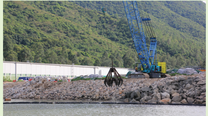
下圖：搬遷現有海堤護面石塊以留待日後建造新海堤 Below: Relocate armour rocks on existing seawall for future construction of new seawall