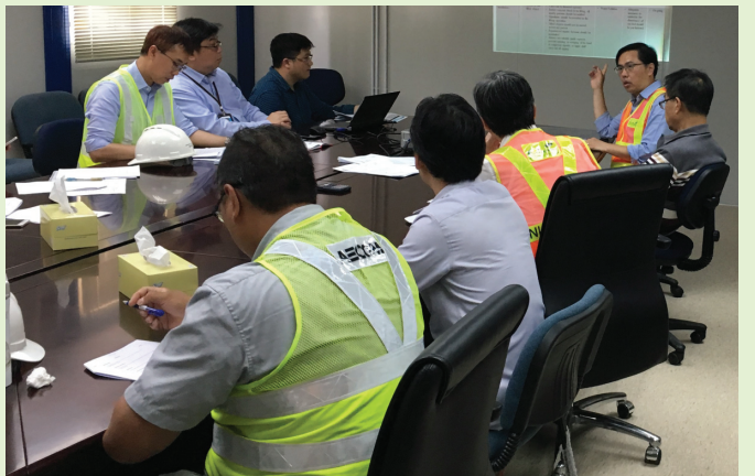
社區聯絡及諮詢工作 Local community liaison and consultation