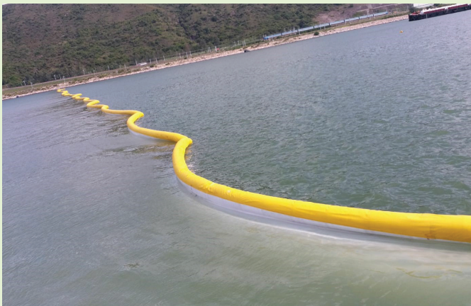
安裝隔泥幕 Installation of silt curtains