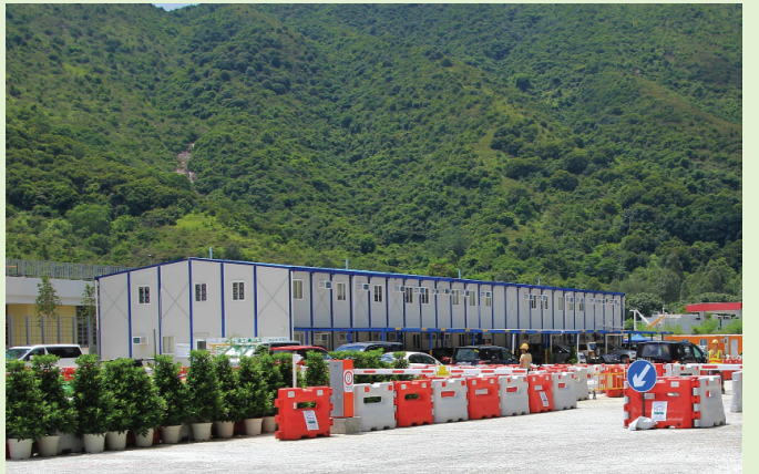
興建地盤辦公室 Construction of site office