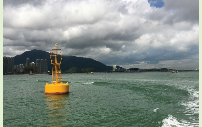
設有浮標的航道 Provision of buoyed channel