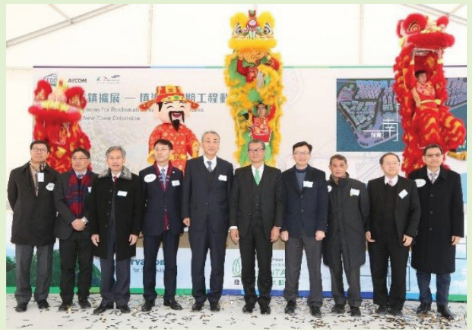
財政司司長陳茂波主持東涌新市鎮擴展 - 填海及前期工程動工典禮 (2018年2月5日)