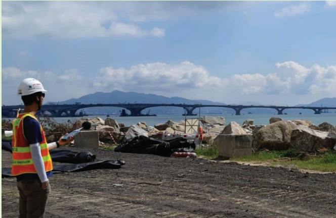
環境基線監測 Environmental baseline monitoring