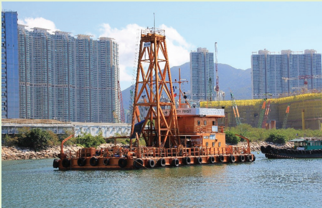
海上勘探工作 Marine ground investigation